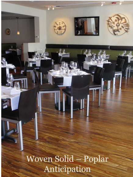
Woven Solid – Poplar Anticipation